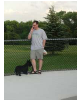
Family Picnic Jones County Park