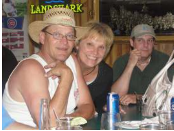
A night at Papa's Sports Bar